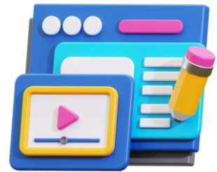
Photo & Video: Best Practices

Strong images and video content is critical to promoting your centre on social media.