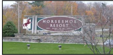
OACAO CONFERENCE OCTOBER, 19—21, 2008